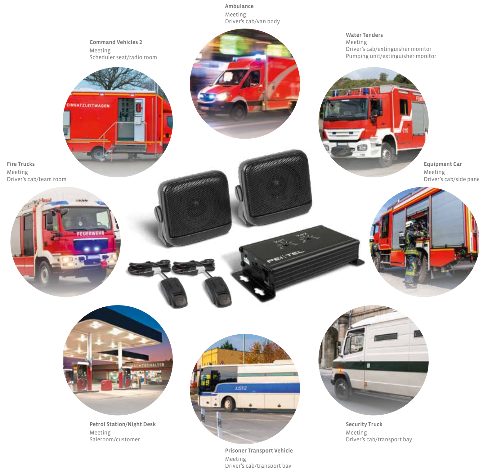
Fire Trucks Meeting Driver's cab/team room